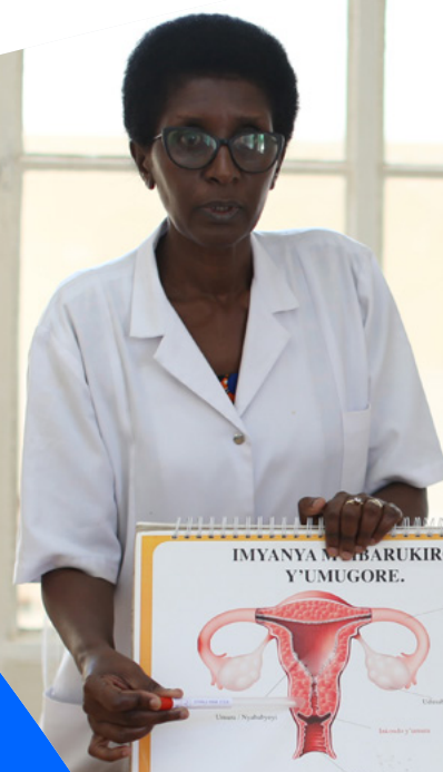
Photo: A healthcare worker in Rwanda explains cervical cancer screening to one of the many women who are now accessing critical preventive services, December 2022, Kigali, Rwanda. © Unitaid

These initiatives, which we launched in response to the WHO's initial call to action in 2019, have helped kickstart cervical cancer elimination programs in 14 low- and middle-income countries and are laying the foundation for global scale up.